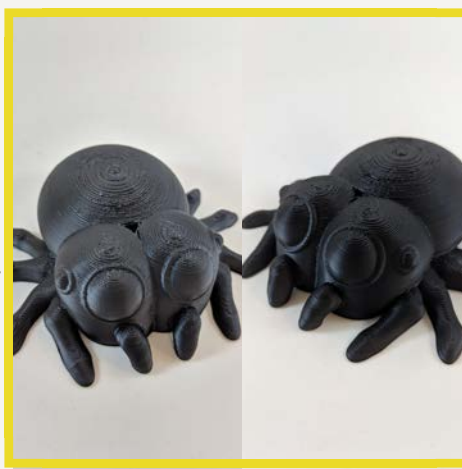
This 3D printed spider peruses Library shelves