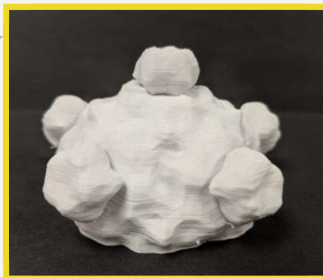
This 3D printed bacteria allows students to view bacteria sans microscope

These are just a few highlighted projects from 2018! To view more MILL projects, visit MILL social media or check out past newsletters at mill.lib.uidaho.edu/index.php/newsletter/