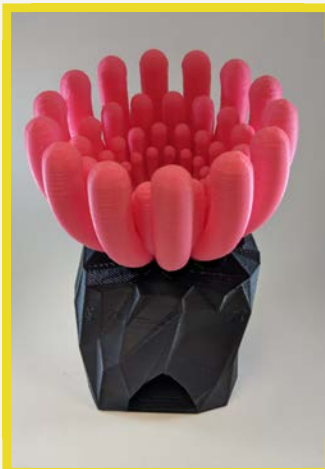
3D printed dice tower