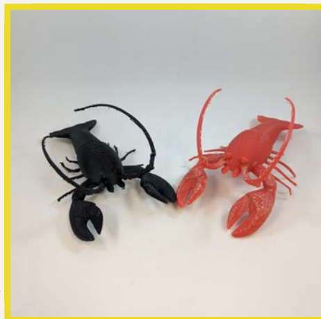
These lobsters were 3D printed for UI Library's "Shelfie Week"