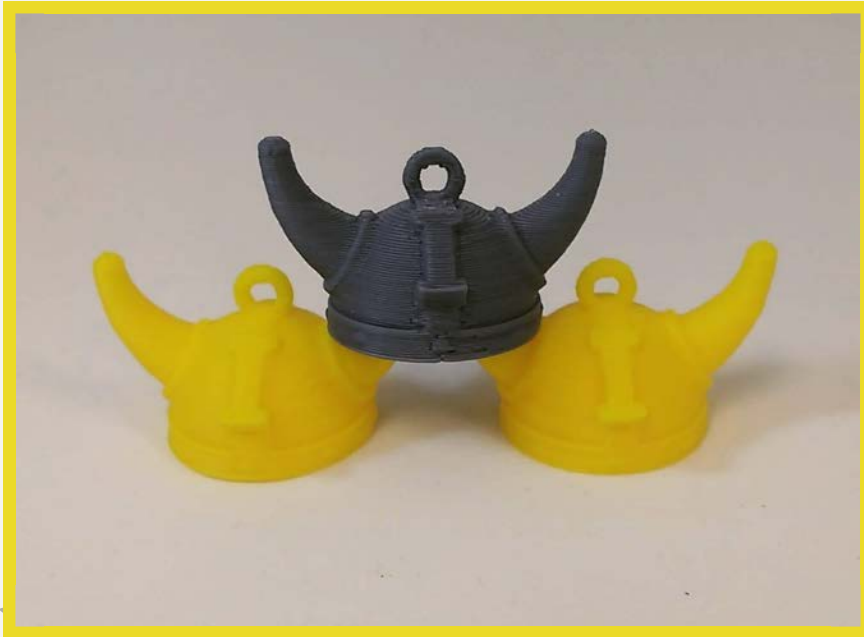
3D printed Vandal helmets made their debut in the MILL in 2018

These workshops will take place on their respective dates from 12:00pm-1:00pm in the MILL