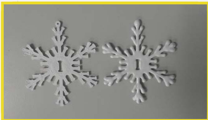
3D printed UI snowflake, before and after acetone vapor bath